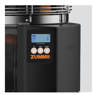
Higher juice extraction speed