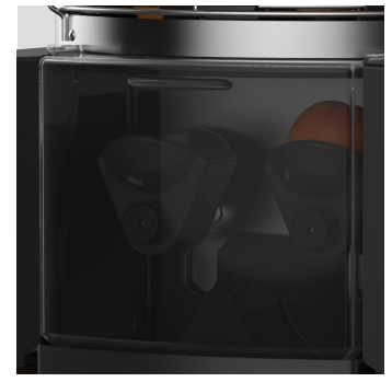
Smoky grey front cover